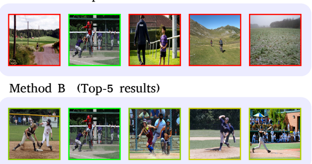
Figure 1. According to the Recall@5 metric, defined for Image Text Matching, both methods A and B are equally good: it considers only one image as relevant for a given sentence query. In this paper we present two metrics and an adaptive margin loss that takes into account that there might be other relevant images in the dataset. In this Figure we represent the semantic similarity of images to the query by their colored border (the greener the more similar).

ing an image. Framing the previous notion into consideration, we explore the task of Image-Text Matching (ITM) in a cross-modal retrieval scenario. Image-text matching refers to the problem of retrieving a ranked list of relevant representations of the query portrayed by a different modality. Yet, somehow contrary to the notion of discrete infinity, commonly used datasets for the image-text matching (ITM) task lack exhaustive annotations of many-to-many mappings between images and captions. These datasets are designed originally for the image captioning task. Nonetheless, the assumption in ITM is that only 5 sentences correctly describe a single image, labeling it in a binary manner as relevant or irrelevant. Consequently, the lack of many-tomany annotations causes a direct effect on the way the ITM task is evaluated. Sentences that are not relevant according to the ground-truth can describe an image in various degrees of correctness and coverage, thus making the way