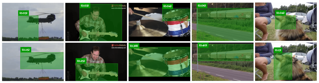
Figure 3. Qualitative comparison of VISUAL-ONLY (top) and our proposed SOUND-ATTENTION (bottom) with clean labels on VGGSound. We show boxes with the highest confidence for each image. The ground-truth objects are helicopter, guitar, drum, train, dog in this order.