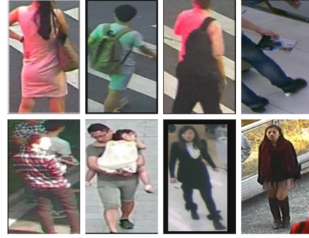
Figure 3. Annotation challenges – For the first three images, the real color of the clothing differs from the color seen. In the fourth image, the upper body is missing. Sometimes the primary person is difficult to tell, as can be seen in the first two images of the second row. Do leggings make the lower-body clothing long? (yes) Do long boots make the lower body clothing long? (no)

We attempt to mitigate several issues regarding PAR datasets with our dataset. First, these are highly unbalanced regarding some attributes. In UPAR, even less represented attributes show at least 446 examples. However, the gap between the less and best-represented attributes remains significant. This is because of the data context and camera configuration in which the datasets were captured. The environment (market, mall, campus, etc.) greatly impacts the distribution of clothing and demographics. Publicly available datasets tend to have biases towards ethnicity and cultures, e.g., mostly representing western or south-east Asian cultures. We slightly mitigate this by unifying four large datasets. Future works should focus explicitly on representing larger and more diverse communities with diverse clothing. While not specifically addressing this, the increased diversity of our dataset tends to mitigate the involuntary learning of biometrics. Second, researchers are confronted with privacy issues and human rights violations when gathering a real-world dataset. From a research point of view, PAR datasets should be captured by real-world surveillance cam-