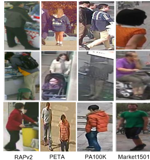
Figure 1. PAR datasets – Sample images from different PAR datasets [4, 25, 22]. Each dataset shows different characteristics and scenarios. However, meaningful out-of-distribution evaluation was impossible due to a low number of common attributes across the datasets. Our UPAR dataset unifies 40 attributes and thus enables cross-domain investigations.

Pedestrian analysis poses an essential task due to the fastly growing demand for intelligent video surveillance as well as online retailing. Relevant sub-tasks are Person Attribute Recognition (PAR), which aims to determine the semantic attributes of people given a person image, and attribute-based person retrieval, which searches for im-