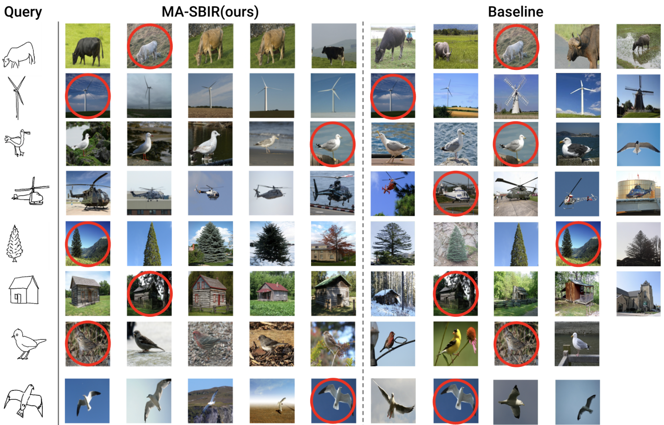
Figure S1. FG-ZS-SBIR . Top-5 Retrieved images on Sketchy. Correct samples are circled.

We provide the full resolution of our qualitative results in Fig. S1 and S2. Note that we did not reproduce the baseline in the FG-SBIR settings as we did for categorical SBIR. Consequently, to compare qualitative results of instance-level SBIR, we selected identical queried sketches as those in the baseline paper. The retrieved photos in baseline column in Fig. S1 are sourced from the qualitative results presented in the baseline paper (Fig. 9 in their supplementary material).