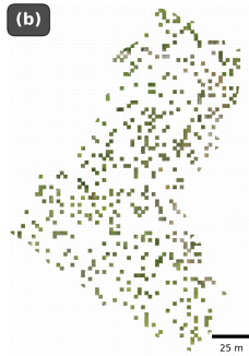
Training Data Coverage 500 Annotated Tiles (400 train, 100 val)