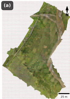
Study Area Tile Index Grid