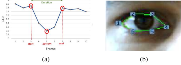
Figure 3. (a) The EAR sequence during an entire blink and the start, bottom and end points. (b) The eye landmarks to define EAR for each frame.

across individuals [9, 11, 27, 21], so features should be normalized across subjects if we are going to train the whole data together at once. In order to tackle this challenge, we use the first third of the blinks of the alert state to compute the mean and standard deviation of each feature for each individual, and then use Equation 6 to normalize the rest of the alert state blinks as well as the blinks in the other two states of the same person( m ) and feature( n ):