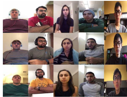
Figure 1. Sample frames from the RLDD dataset in the alert (first row), low vigilant (second row) and drowsy (third row) states.

Drowsiness detection is an important problem. Successful solutions have applications in domains such as driving and workplace. For example, in driving, National Highway Traffic Safety Administration in the US estimates that 100,000 police-reported crashes are the direct result of driver fatigue each year. This results in an estimated 1,550 deaths, 71,000 injuries, and $12.5 billion in monetary losses [4]. To put this into perspective, an estimated 1 in 25 adult drivers report having fallen asleep while driving in the previous 30 days [30, 31]. In addition, studies show that, when driving for a long period of time, drivers lose their self-judgment on how drowsy they are [23], and this can be one of the reasons that many accidents occur close to the destination. Research has also shown that sleepiness can affect workers' ability to perform their work safely and efficiently [1, 22]. All these troubling facts motivate the