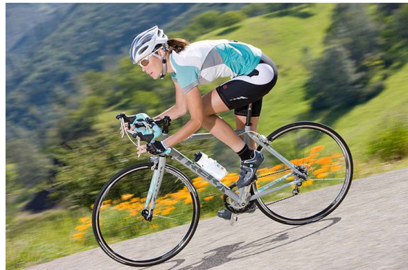
Figure 1: Although a human annotator is going to use labels such as people , bicycle , road for this image, additional labels such as wheel , saddle , pedal , cycling can also be used for labeling.

Popularization of digital cameras, web-based services