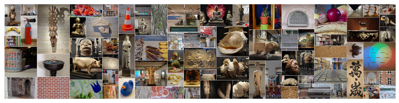
Figure 1. Sample ground-truth images from the Natural Image Noise Dataset.