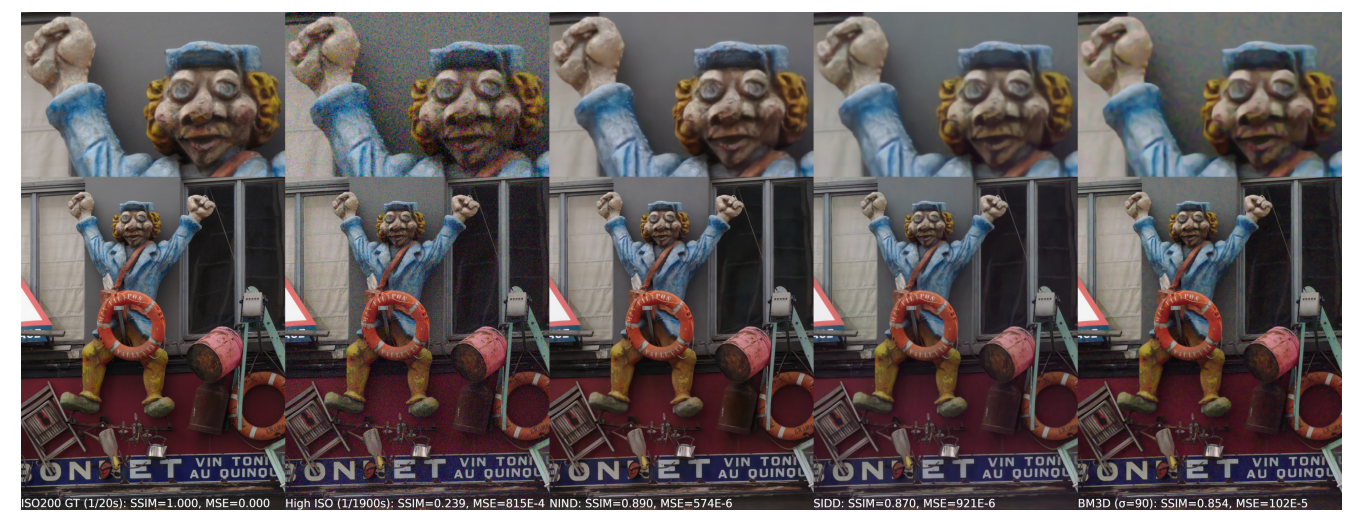
Figure 3. Denoising stefantiek. 1: ISO200 ground-truth (1/20s), 2: high ISO (1/1900s), 3: 2 denoised using U-Net model trained with NIND, 4: 2 denoised using U-Net model trained with SIDD (320-sets), 5: 2 denoised using BM3D ( \sigma = 90^4 )

Table 4. Average SSIM index on 10 NIND:C500D scenes denoised with models trained on NIND:X-T1 or BM3D