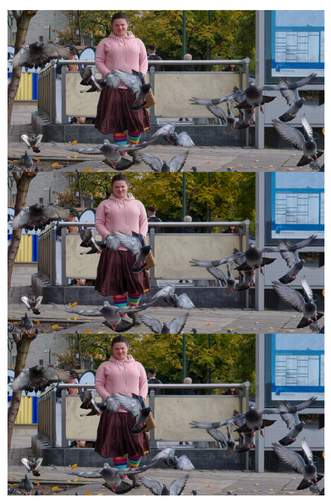
Figure 5. Comparison between a noisy ISO6400 crop (top), one denoised with a model trained on NIND (middle), and one on which BM3D ( \sigma = 30 ) has been applied (bottom). Our model appears to perform well on dynamic scenes despite having been trained on static scenes.

Each network is trained for 48-hours on a GeForce GTX 1080 (11GB). Table 2 shows denoising performance on the