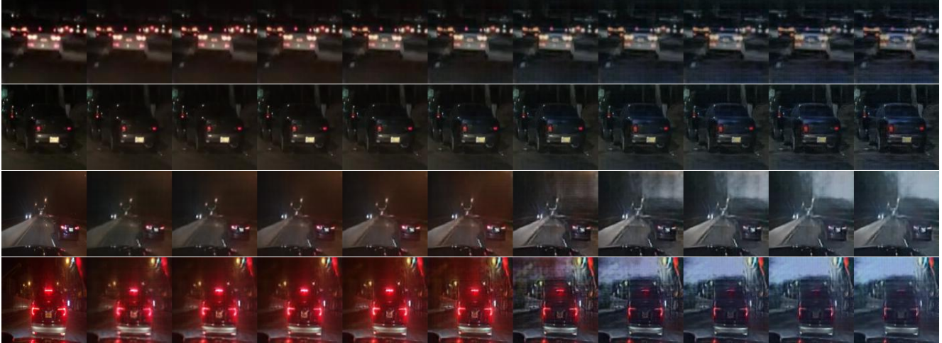
Figure 4. Style manipulation of time of day attributes through a trained Attribute GAN with day and night labels. The first column shows the original image. The next ten columns denote the gradual change in style which is the time of day in this case. The first two rows show gradual change from night to day on images from the test set of crop images. The last two rows exhibit gradual change from night to day on images from the original BDD dataset. This shows that the model trained on crop images from the original dataset generalizes on the original uncropped BDD images. Note that the model learns intuitive transformations by dimming taillights or clearing the sky.

batch size of 32. All experiments were performed on a single workstation equipped with an NVidia Titan X_p GPU in PyTorch [15] v1.0.0.