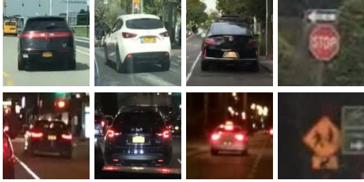
Figure 3. Examples of images from the BDD++ dataset. The first row contains image crops generated with the daytime label. The second row correspondingly shows images generated with the night attribute. The samples show two objects of interest generated by the trained attribute encoder: cars and traffic signs.