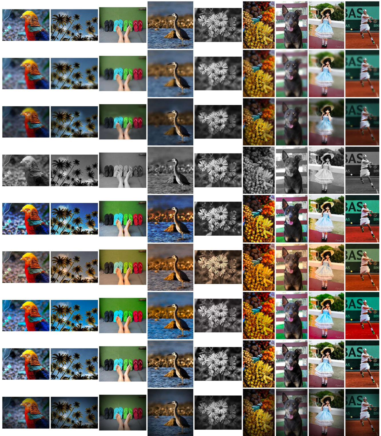
Figure 10: Demonstration of studied editing tools. Top to bottom: sharpening, BG blurring, BG blur + darkening, Grayscale, Contrast increasing, Color temperature (5000K), Vibrance (Saturation) increasing, Clarity ("Structure", local contrast) increasing, Vignetting.