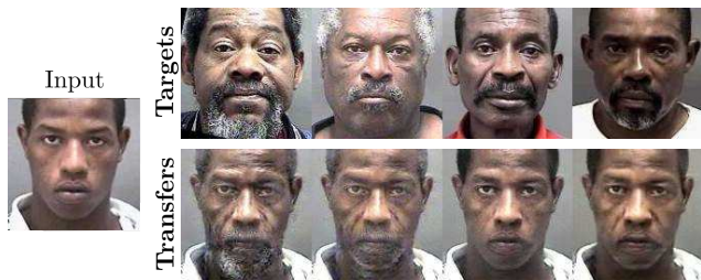
Figure 3: Age progression of an input face using different targets (top row). By conditioning the age transfer on different targets, we are able to synthesize different age-specific facial features.

In this work, we introduce an approach to age progression that is different to the standard paradigm. In particular, the proposed method transfers the age-discriminative style of a target face onto the input face at multiple scales. This approach allows for the generation of diverse aging patterns, based on the choice of target image. This is demonstrated in Fig. 3, where a young (under 30 years old) input face is aged using different target faces over 50 years old. It is evident that different aging patterns (e.g., white hair, beard, and wrinkles) are transferred according to the target.