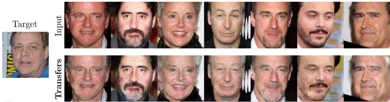
Figure 4: Age progressions of faces over 50 years old. Each input image (top row) is over 50 years old and is translated to the same age group using an older target image. The model is able to transfer more pronounced aging patterns and synthesize older looking faces of the same age group.