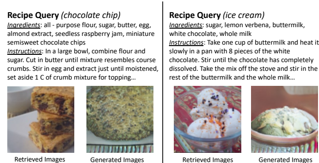
Figure 5: Visualization of the retrieved food images and generated images (generated by r2i translation component) for a query recipe.

the i2r component in Figure 6. The query image is a pork chop. We can see several correctly predicted ingredients for the query image. In fact, it is wholly plausible that using the ingredients predicted, it would be possible to cook the dish to obtain a very similar image as the query image.