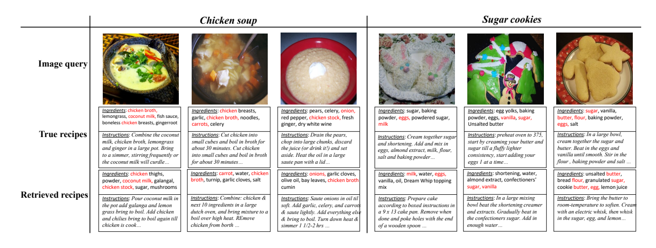
Figure 4: Analysis of Image to Recipe Retrieval on the full 50k test dataset. We consider two food-categories: chicken soup and sugar cookies . We show 3 different image-queries in each of these categories. Below each image is the true recipe, and below that is the top retrieved recipe by ACME. We can observe that our retrieved recipe has several common ingredients with the true recipe.

Figure 3: Analysis of Recipe to Image Retrieval on the full 50k test dataset. The first column denotes the food category, and the second column is the query recipe. The top 5 results retrieved by ACME are shown. The best match (i.e., the ground truth) is boxed in red. In most cases, the top retrieved images display similar concepts as the ground truth.