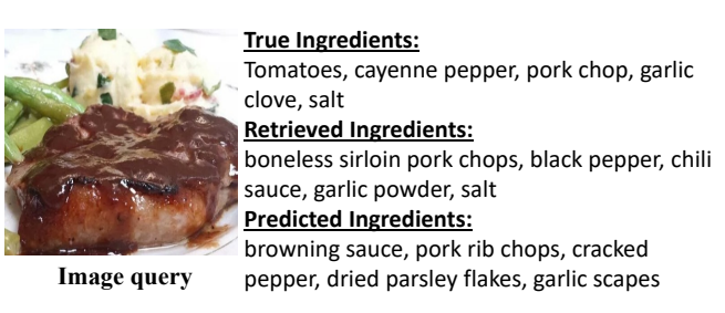
Figure 6: Visualization of the retrieved ingredients and predicted results (predicted by i2r translation component) for query image pork chops.

Figure 5: Visualization of the retrieved food images and generated images (generated by r2i translation component) for a query recipe.