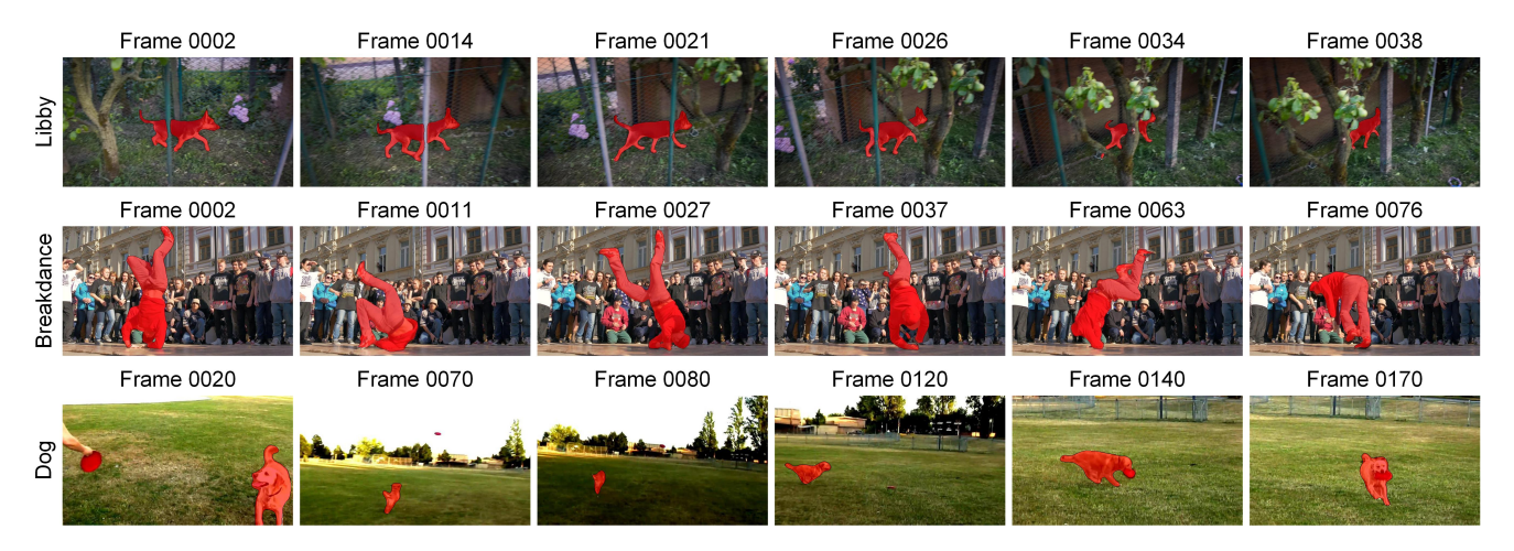
Figure 3: The qualitative segmentation results of STCNN on the DAVIS-2016 (first two rows) and Youtube-Objects (last row) datasets. The output on the pixel level are indicated by the red mask. The results show that our method is able to segment objects under several challenges, such as occlusions, deformed shapes, fast motion, and cluttered backgrounds.