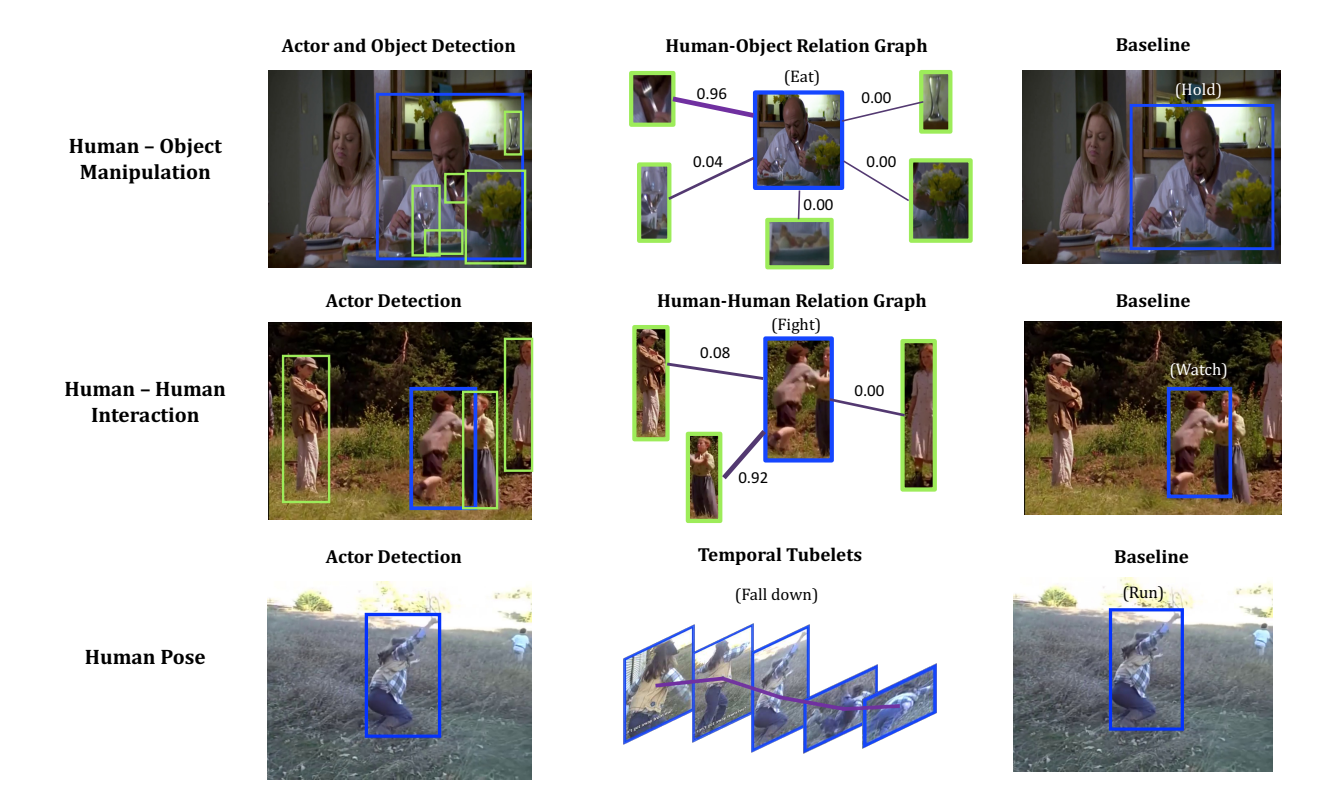
Figure 4. We visualize the performance of our model and the baseline. We show actor and object detections used by our model in the first column, the corresponding instantiations of the graphs in the second column, and baseline results in the third column.