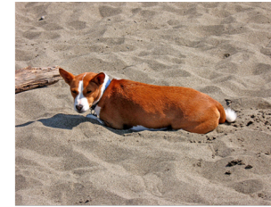
n02110806 Guiding Object: basenji Base model: a dog laying on the sand near a tree CGO: a basenji laying on the sand near a tree