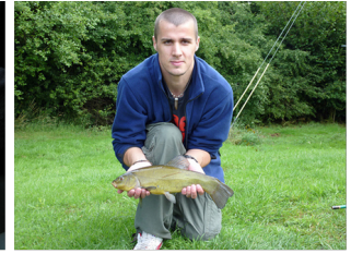
Base model: a man holding a green frisbee in his hand CGO: a man holding a tench in his hand