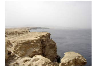
Base model: a rock rock with a rock and a rock CGO: a promontory with a rock and a rock