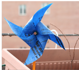
n03944341 Guiding Object: pinwheel Base model: a blue and blue bird with a blue and blue flower CGO: a blue pinwheel with a blue and blue flower on it