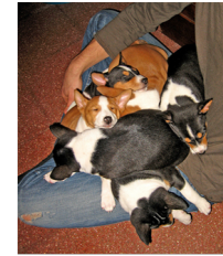
Base model: a group of dogs laying on a couch with a person CGO: two dogs and a basenji are laying on a couch