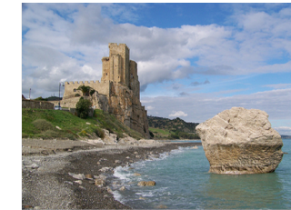
n09399592 Guiding Object: promontory Base model: a stone castle with a castle in the background CGO: a promontory with a castle in the background