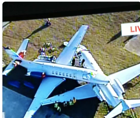
Figure 1. A Crisis-related Image-text Pair from Social Media

Oh shit....no injuries..no fire...but somehow two private jets here just North of San Antonio Airport...bizarre accident..