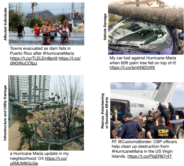
Figure 2. Samples from Task 2; Event Classification with Texts and Images.

AI for Emergency Response: Recent years have seen an explosion in the use of Artificial Intelligence for Social Good [22, 20, 4]. Social media has proven to be one of most relevant and diverse resources and testbeds, whether it be for identifying risky mental states of users [11, 17, 21], recognizing emergent health hazards [16], filtering for and detecting natural disasters [48, 40, 47], or surfacing violence and aggression in social media [10].