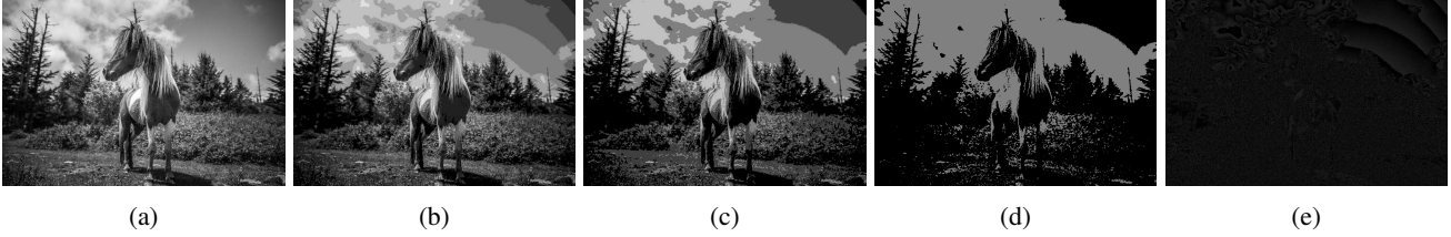
Figure 1: (a) Original 8-bit image (b) Weighted sum of (higher) bit planes 7, 6 and 5 (c) Weighted sum of (higher) bit planes 7 and 6 (d) Bit plane 7 - Most significant bit plane (e) Weighted sum of (lower) bit planes 4, 3, 2, 1 and 0.

restrict x' to be in the \ell_\infty -ball of radius \varepsilon around x . The set of Adversarial Samples can be formally defined as follows: