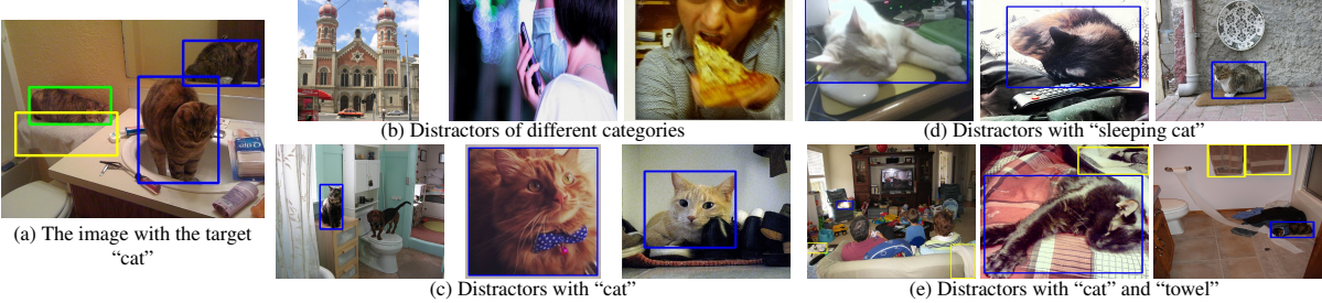
Figure 1: An example from the new Cops-Ref dataset for compositional referring expression comprehension. The task requires a model to identify a target object described by a compositional referring expression from a set of images including not only the target image but also some other images with varying distracting factors as well. The target/related/distracting regions are marked by green/yellow/blue boxes, respectively. More details about the reasoning tree can be seen in Sec. 3.1.

Expression: The cat on the left that is sleeping and resting on the white towel.