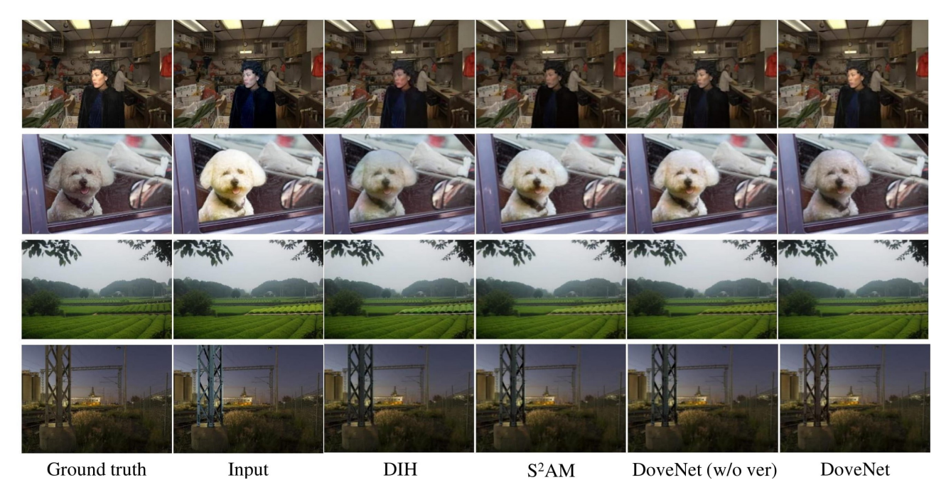
Figure 3: Example results of different methods on our four sub-datasets. From top to bottom, we show one example from our HAdobe5k, HCOCO, Hday2night, and HFlickr sub-dataset respectively. From left to right, we show the ground-truth real image, input composite image, DIH [43], S<sup>2</sup>AM[45], our special case DoveNet (w/o ver) and our full method DoveNet.

and DoveNet. DoveNet (w/o ver) corresponds to "U-Net+att+adv" in Table 3, which removes domain verification discriminator from our method. We observe that our proposed method could produce the harmonized images which are more harmonious and closer to the ground-truth real images. By comparing DoveNet (w/o ver) and DoveNet, it can be seen that our proposed verification discriminator is able to push the foreground domain close to the background domain, leading to better-harmonized images.