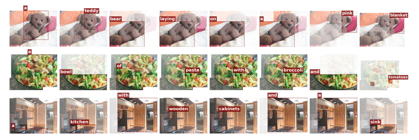
Figure 4: Visualization of attention states for three sample captions. For each generated word, we show the attended image regions, outlining the region with the maximum output attribution in red.