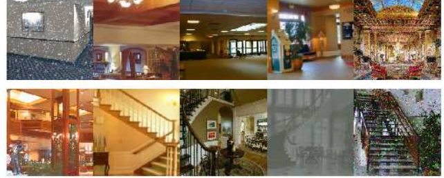
Figure 2: TransPrior user transformations following [7] with severeness three, including: spatters, elastic transformation, saturation, defocus blur, Gaussian noise, brightness, Gaussian blur, jpeg compression, contrast and impulse noise.

each preference 250 extra MITIS images. The 20 evaluation images per category are equally divided over users. All user data is mutually exclusive.