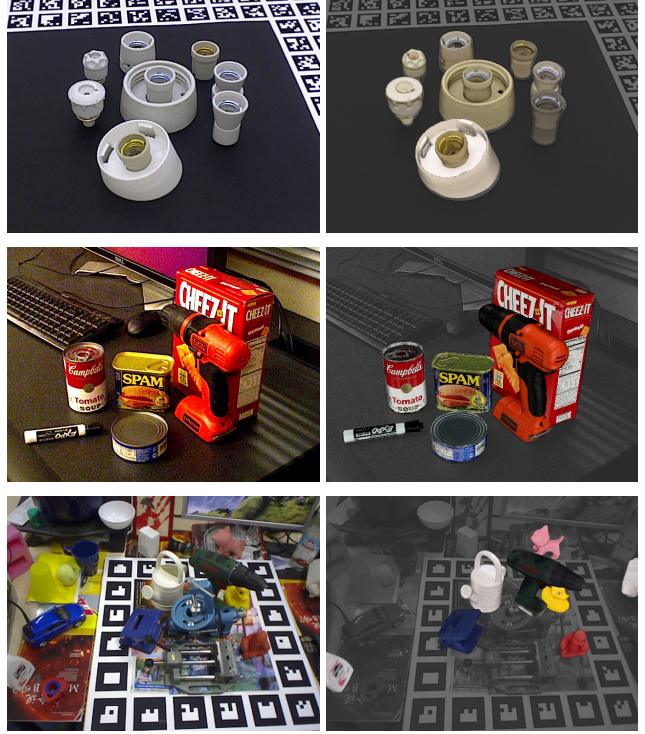
Figure 3. Example EPOS results on T-LESS (top), YCB-V (middle) and LM-O (bottom). On the right are renderings of the 3D object models in poses estimated from the RGB images on the left. All eight LM-O objects, including two truncated ones, are detected in the bottom example. More examples are on the project website.