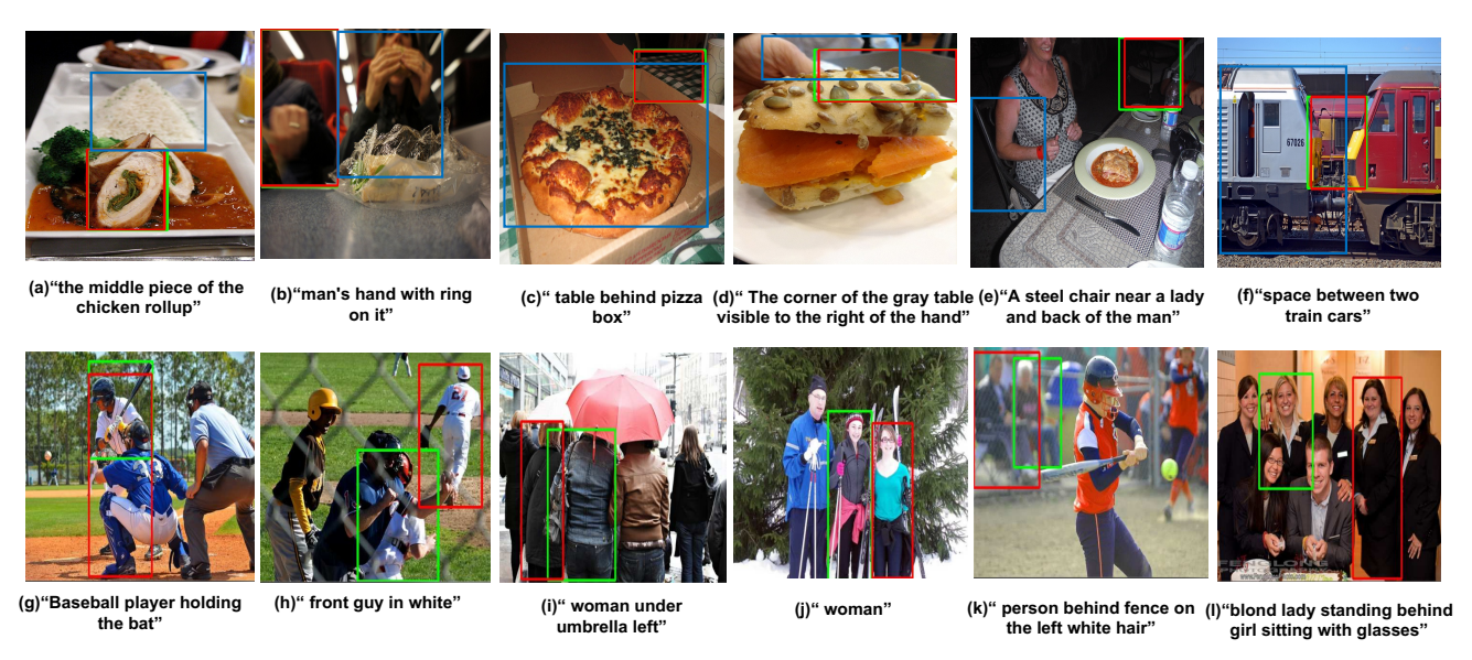
Figure 3. Visualization results on RefCOCO series dataset. The first row (a-f) shows the comparisons of our approach with the state-of-the-art method MAttNet. The second row shows some representative failure cases of our method. The red bounding-box represents the prediction of our method, the blue bounding-box represents the prediction of MAttNet, and the green bounding-box is the corresponding ground-truth.

a deeper network Hourglass-104 [15] in a single level setting. Comparing to the row 5, this setting has just improved a little, but this setting is much slower than our basic setting with DLA-34 during inference and training. More than 100 hours are needed for training and the inference speed is much lower.