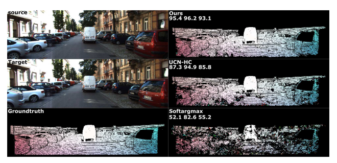
Figure 4. Qualitative comparison of feature matching performance in KITTI Flow 2015 [21]. The optical flow estimates from three dense descriptors for the same source-target image pair are shown in this figure. The descriptors are our method, UCN-HC [4], and the proposed method trained with Softargmax [12] instead of RR. The numbers shown in each image in the second column represent the putative match ratio, precision, and matching score of the optical flow estimates. We use the cycle consistency criterion with 6px threshold to rule out potential false matches. The images in the first column are source, target, and groundtruth dense optical flow map, where black values mean there are no valid measurements. The second column shows the dense optical flow estimates, where the black pixels include those with no groundtruth measurements or ruled out with cycle consistency criterion.