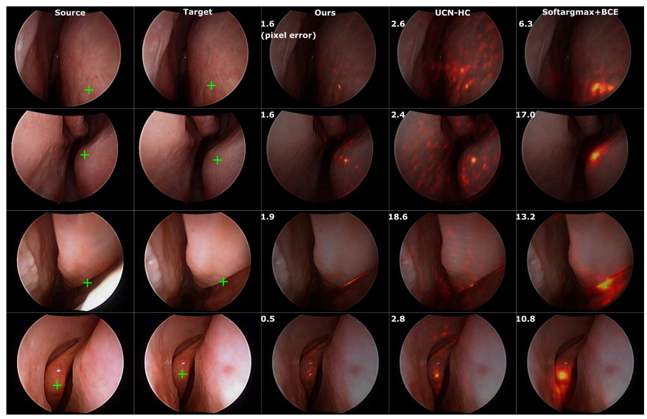
Figure 3. Qualitative comparison of feature matching performance in endoscopy. The figure qualitatively shows the performance of three dense descriptors trained with different loss designs on the task of pair-wise feature matching. The first two rows are training images and the rest are testing ones. The first and second columns show the source-target image pairs, where the green crossmarks indicate the groundtruth source-target point correspondences. For each dense descriptor, a target heatmap, as shown in the last three columns, is generated from the POI Conv Layer. To visualize the contrast better, the displayed heatmap is normalized with spatial softmax operation and then with the maximum value of the processed heatmap. The numbers shown in the last three columns are the pixel errors between the estimated target keypoint locations and the groundtruth ones. The fourth column shows the results of UCN [5] trained with recent Hardest Contrastive Loss on the endoscopy dataset. The model in the fifth column is trained with the same method as ours except that the training loss is Softargmax [12] and BCE instead of the proposed Relative Response Loss. The results show that our method produces fewer high responses, which leads to better matching accuracy.