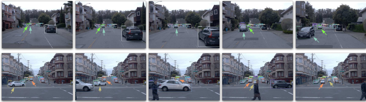
Figure 1: Example vehicle tracking results on the Waymo Open Dataset — tracks are color coded and for clarity we highlight two tracks in each sequence with arrows. Challenges in this dataset include small objects, frequent occlusions due to other traffic or pedestrians, changing scales and low illumination.