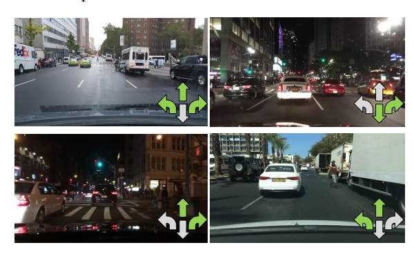
Figure 2. Scenes in BDD-OIA. The green arrows in the bottom right show the ground truth for possible actions.

side of the street, that are not action inducing and a few object inducing objects per scene. action-inducing objects can be other vehicles, pedestrians, traffic lights, or open lanes.