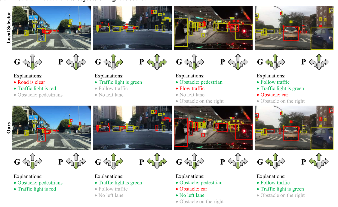
Figure 4. Examples of network predictions, objects selected as action-inducing, and explanations. Yellow bounding boxes identify the objects detected by the Faster R-CNN, while red bounding boxes identify the objects selected as action-inducing by the proposed network. "G" stands for ground truth and "P" for prediction. For explanations, green indicates true positives, red false positives, and gray false negatives ( i.e. valid explanations not predicted).

larger gains in action prediction performance.