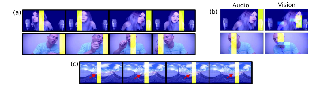
Figure 4. (a) Sound localization results on YouTube-ASMR using audio only. (b) Comparison of localization results using the spatial cues captured by the audio sub-network (left) and the regions of importance of the visual sub-network (right). The visual attention of the model is localized to sound sources and corresponds to the spatial cues learned by the audio sub-network. (c) Sound localization results on YouTube-360 using audio only.

naFace [9] provide a cheap yet reliable source of pseudo ground-truth labels. Our task is motivated by Gan et al. [12], which proposes tracking vehicles from stereo sound and camera metadata without visual input.