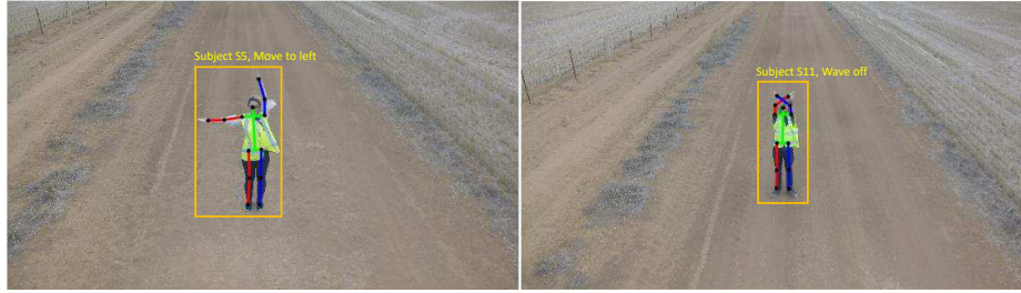
Fig. 2. Examples of body joint annotations. Image on the left is from the Move to left class, whereas the image on the right is from the Wave off class.