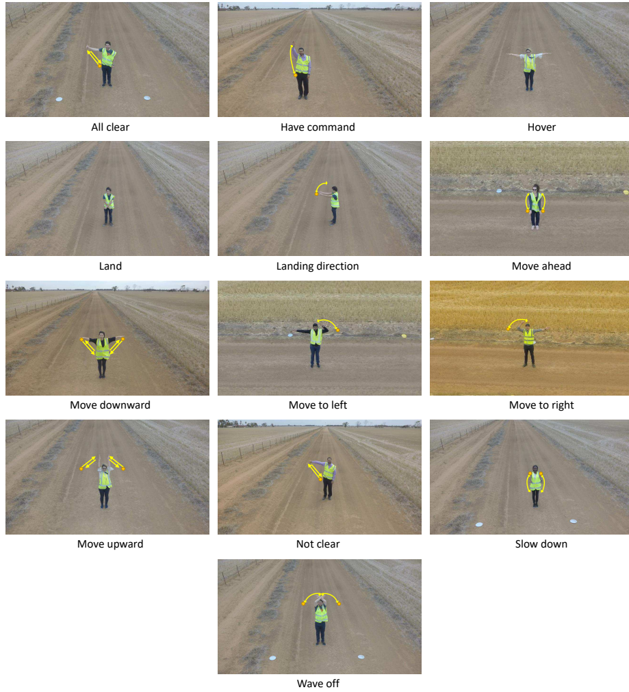
Fig. 1. The selected thirteen gestures are shown with one selected image from each gesture. The arrows indicate the hand movement directions. The amber color markers roughly designate the start and end positions of the palm for one repetition. The Hover and Land gestures are static gestures.