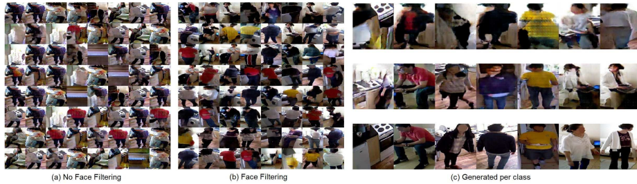
Fig. 2. DCGAN Synthesis Examples. Samples generated by G(z) with (b) or without (a) semantic controller. (c) 1 st row: Examples of generated images from G_0 and G_j without semantic controller; 2 nd row: with semantic controller; 3 rd row: original samples from X_0 and \{X_j\} . Columns in (c) are, from left to right, ‘unknown’ identity 0 and identities j \in \{1, \dots, N\} , respectively.

19,732 images for testing and 12,936 images for training generated by a deformable part model [4].