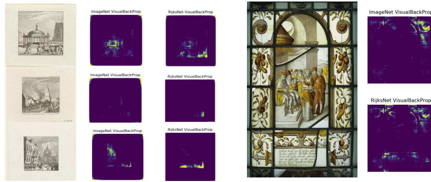
Fig. 4: A visualization that shows the differences between which sets of pixels in an image are considered informative for a DCNN which is only pre-trained on ImageNet, compared to the same architecture which has also been fine tuned on the Rijksmuseum collection. It is clear how the latter neural network develops novel selective attention mechanisms over the original image.

third images), or even to non informative pixels at all, as shown by the second image. However, the fine tuned DCNN shows how these saliency maps change towards the set of pixels that correspond to the portions of the images representing people in the bottom, suggesting that this is what allows the DCNN to appropriately recognize the artist. Similarly, on the right side of the figure we report which parts of the original image are the most useful ones when it comes to classify the type of the reported heritage object, which in this case corresponds to a glass wall of a church. We can see how the pre-trained architecture only identifies as representative pixels the right area above the arch, which turned out to be not informative enough for properly classifying this sample of the Rijksmuseum dataset. However, once the DCNN gets fine tuned we clearly see how in addition to the previously highlighted area a new saliency map occurs on the image, corresponding to the text description below the represented scene. It turns out that the presence of text is a common element below the images that represent clerical glass windows and as a consequence it is recognized by the fine tuned DCNN as a representative feature.