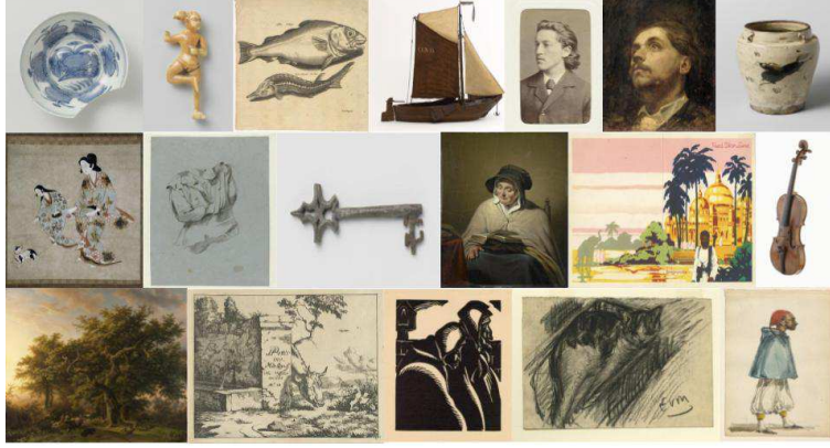
Fig. 1: A visualization of the images that are used for our experiments. It is possible to see how the samples range from images representing plates made of porcelain to violins, and from Japanese artworks to a more simple picture of a key.

Our second approach is generally known as fine tuning and differs from the previous one by the fact that together with the final softmax output the entire DCNN is trained as well. This means that unlike the off the shelf approach, the entirety of the neural architecture gets “unfrozen” and is optimized during training. The potential benefit of this approach lies in the fact that the DCNNs are independently trained on samples coming from the artistic datasets, and thus their classification predictions are not restricted by what they have previously learned on the ImageNet dataset only. Evidently, such an approach is computationally more demanding.