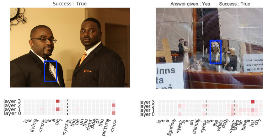
Fig. 4: Guesser and Oracle attention mechanism in the crop visual pipeline.

out the object as a human would might. Thus, we provide an initial baseline that scores up to 84.0% error in the supplementary material in Tab 7.