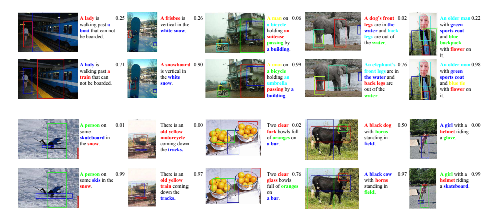
Fig. 6: Qualitative FOIL results: We present the image with foil sentence (top) and correct sentence (bottom) as determined by our phrase-critic model. The numbers indicate our phrase-critic score of the given sentence. By design our model grounds all the phrases in the sentence, including the foil phrases.

Table 3: Quantitative FOIL results: Our phrase critic significantly outperforms the stateof-the-art [31,16] reported in [24] and the Grounding model [10] on all three FOIL tasks.