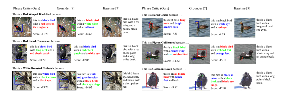
Fig. 3: Our phrase-critic model generates more image-relevant explanations compared to [8] justified by the grounding of the noun phrases. Compared to Grounder [10], our phrase-critic generates more class-specific explanations. The numbers indicate the cumulative score of the explanation computed by our phrase-critic ranker.

and failure cases as well as quantitatively through human judgement. We then present results illustrating the accuracy of the detected bounding boxes. We finally discuss our counterfactual explanation results.