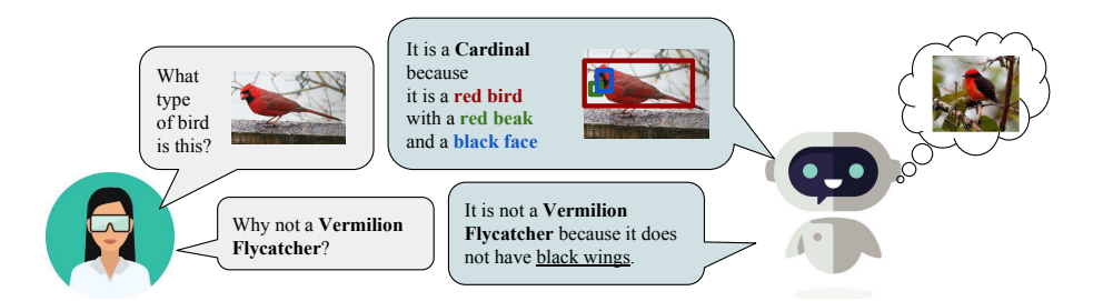
Fig. 1: Our phrase-critic agent considers grounded visual evidence to determine if candidate explanations are image relevant. In this example, as many cardinals are red and have a black patch on their faces, mentioning and grounding those properties constitutes an effective factual explanation, i.e. rationalization. Furthermore, in our framework, informing the user of why an image does not belong to another class via the absence of certain attributes constitutes a counterfactual explanation.

through a phrase-critic which explicitly determines if an explanatory sentence is image relevant by visually grounding discriminative object parts mentioned in an explanation.