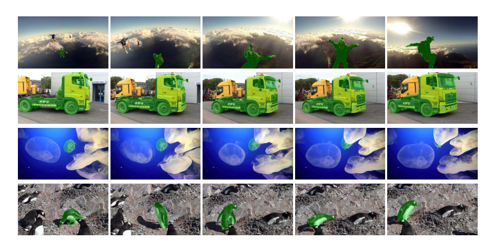
Fig. 4: Some visual results produced by our model without online learning on the YouTube-VOS test set. The first column shows the initial ground truth object segmentation (green color) while the second to the last column are predictions.

two rows are from unseen categories. In addition, each example represents some challenging cases in video object segmentation. For example, the person in the first example has large changes in appearance and illumination. The second and third examples both have multiple similar objects and heavy occlusions. The last example has strong camera motion and the penguin changes its pose frequently. Our model obtains accurate results on all the examples, which demonstrates the effectiveness of spatial-temporal features learned from large-scale training data.