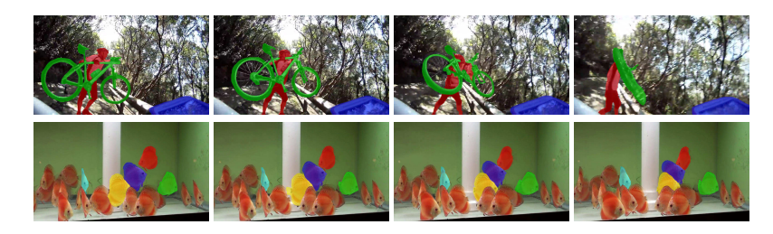
Fig. 1: The ground truth annotations of sample video clips in our dataset. Different objects are highlighted with different colors.