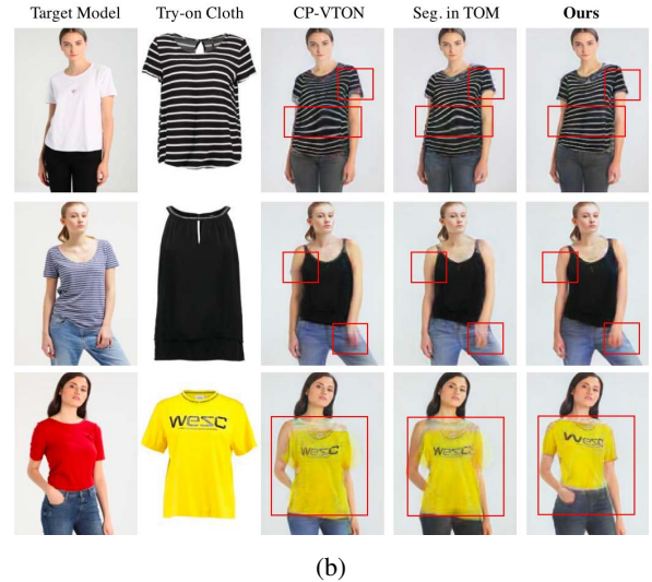
Figure 3: The proposed approach results in robust cloth transformations and generates more realistic image-based virtual try-on results that preserve well key characteristics of the in-shop clothes and fit the body well. From the example results, it can be seen that CP-VTON fails at fitting the cloth properly, handling bleeding, occlusion and preserving texture details.