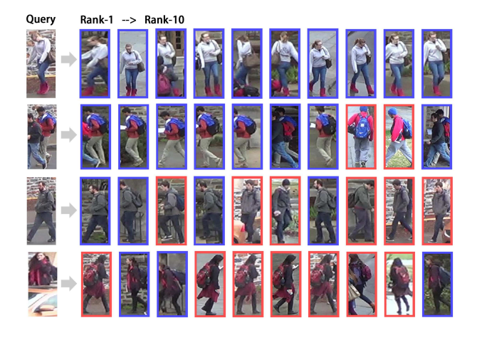
Figure 6. Sample retrieval results on DukeMTMC-reID using the proposed method. The images in the first column are the query images. The retrieved images are sorted according to the similarity scores from left to right. The correct matches are in the blue rectangles, and the false matching images are in the red rectangles. DukeMTMC-reID is challenging because it contains pedestrians with occlusions and similar appearance.

Comparison with the state-of-the-art methods. We compare our method with the state-of-the-art methods on Market-1501 and CUHK03, listed in Table 1 and Table 5, respectively. On Market-1501, we achieve rank-1 accuracy = 78.06%, mAP = 56.23% when using the single query mode, which is the best result compared to the published papers, and the second best among all the available results including ArXiv papers. On CUHK03, we arrive at rank-1 accuracy = 73.1%, mAP = 77.4% which is also very competitive. The previous best result is produced by combining the identification and verification losses [10, 52]. We further investigate whether the LSRO could work on this model. We fine-tuned the publicly available model in [52] with LSRO and achieve state-of-the-art results rank-1 accuracy = 83.97%, mAP = 66.07% on Market-1501. On CUHK03, we also observe a state-of-the art performance rank-1 accuracy = 84.6%, mAP = 87.4% . We, therefore, show that the LSRO method is complementary to previous methods due to the regularization of the GAN data.