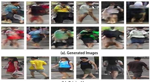
(b). Original Images