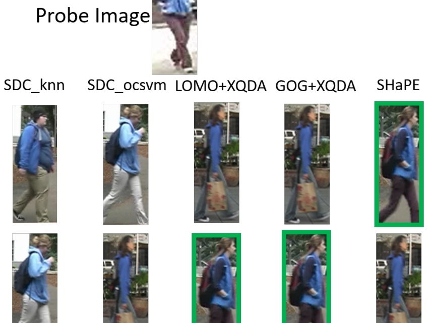
Figure 1: An example probe image with the top 3 matches for re-identification results using 5 individual algorithms and their consensus using SHaPE for VIPeR dataset