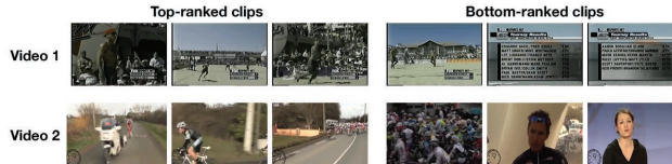
Figure 3: Top-ranked and bottom-ranked clips by SCSampler for two test videos from Sports1M. Top-ranked clips often show the sports in action, while bottom-ranked clips tend to be TV-interviews or static segments with scoreboard. Clips are shown as thumbnails. To see the videos please visit http://scsampler.ai .

While our SCSampler has low computational cost, it adds the procedural overhead of having to train a specialized clip selector for each classifier and each dataset. Here we evaluate the possibility of reusing a sampler s(\cdot) that was optimized for a classifier f on a dataset \mathcal{D} , for a new classifier f' on a dataset \mathcal{D}' that contains action classes different from those seen in \mathcal{D} . In Table 3, we present cross-dataset performance of an SCSampler trained on Kinetics but then used to select clips on Sports1M (and vice-versa). We also report cross-classifier performance obtained by optimizing SCSampler with pseudo-ground truth labels (see section 3.2.2) generated by R(2+1)D-18 but then used for video-level prediction with action classifier MC3-18. On the Kinetics validation set, using an SCSampler that was trained using the same action classifier (MC3) but a different dataset (Sports1M) causes a drop of about 2% (65.0% vs 67.0%) while training using a different action classifier (R(2+1)D) to generate pseudo-ground truth labels on the the same dataset (Kinetics) causes a degradation of 1.1% (65.9% vs 67.0%). The evaluation on Sports1M shows