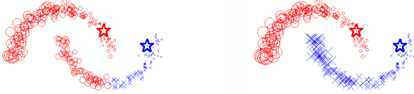
Figure 1: Illustration of usefulness of diffusion processes for retrieval. Affinities before (left) and after (right) the diffusion are used to assign each element to the highlighted query samples according to their pairwise affinities. As can be seen, pairwise affinities alone are not sufficient to capture the intrinsic structure of the data manifold. Applying a diffusion process spreads affinities and allows to significantly improve retrieval performance (best viewed in color).

sion based on evolutionary dynamics. Finally, it turns out, that all these methods can be summarized into one, generic diffusion framework, which we describe in Section 3. Related work represents specific instances of our generic definition and this allows us to propose several new algorithms, by simply combining the most promising ideas of the related papers. We finally provide an evaluation, focusing on highlighting the ideas that have the highest influence on the retrieval scores. In such a way, we are able to derive a formulation that e. g. obtains a 100% bullseye score on the popular MPEG7 data set, as it is shown in Section 4.