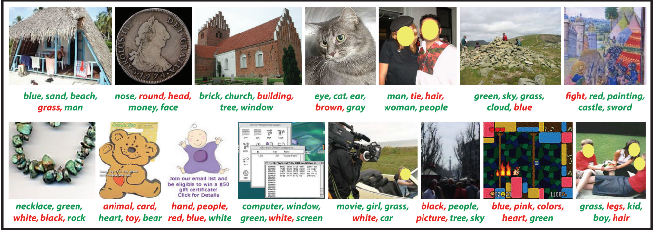
Figure 3. Example images from ESP Game dataset and the corresponding top 5 tags predicted using NMF-KNN are shown in this figure. Predicted tags in green appear in the ground truth while red ones do not. In many cases, even though the proposed method has predicted relevant tags to the image, those tags are missing in the ground truth. That is because the tag lists are not complete and are generally a subset of relevant tags.