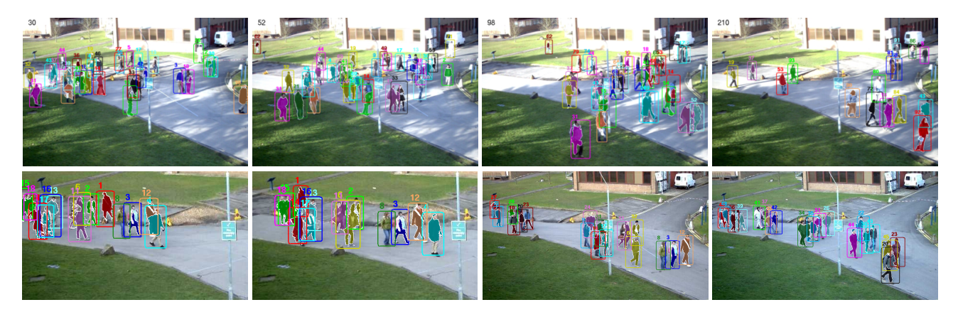
Figure 4: Qualitative tracking and segmentation results on the sequences S2L2 (top) and S1L1-2 (bottom).

Table 4: Evaluation in scene space within a pre-defined tracking area, averaged over 6 six sequences ( top ) and 5 sequences ( bottom ): S2L1, S2L2, S2L3, S1L1-2, S1L1-1.