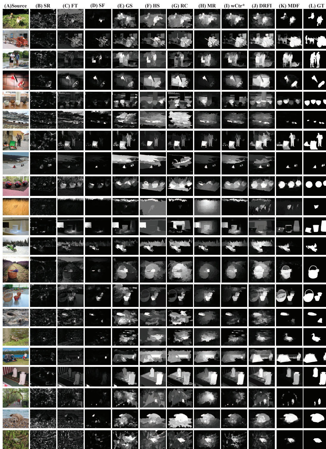
Figure 5: Visual comparison of saliency maps generated from 10 different methods, including ours (MDF). The ground truth (GT) is shown in the last column. We compare MDF against spectral residual (SR[3]), frequency-tuned saliency (FT [1]), saliency filters (SF [5]), geodesic saliency (GS [6]), hierarchical saliency (HS [7]), regional based contrast (RC [2]), manifold ranking (MR [8]), optimized weighted contrast (wCtr* [9]) and discriminative regional feature integration (DRFI [4]).