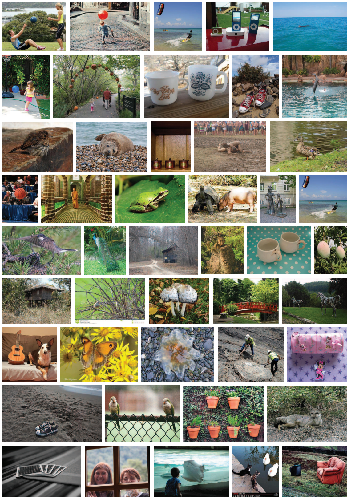
Figure 3: Sample images in our dataset.