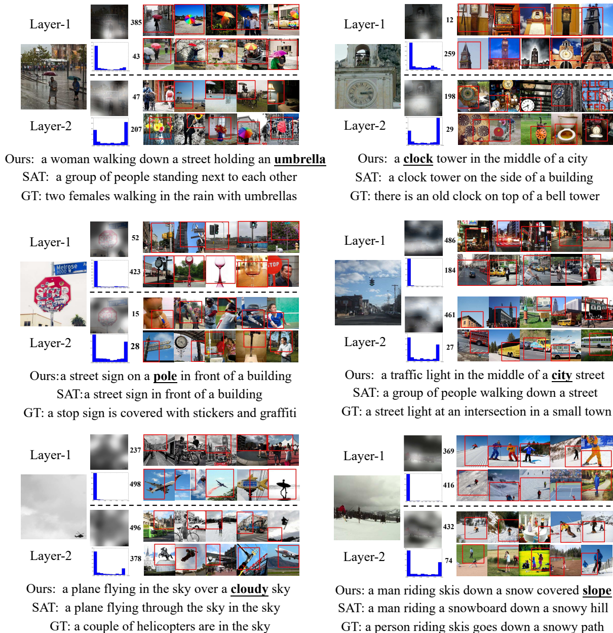
Figure 3. Examples of visualization results on spatial attention and channel-wise attention. Each example contains three captions. Ours(SCA-CNN), SAT(hard-attention) and GT(ground truth). The numbers in the third column are the channel numbers of VGG-19 network with highest channel attention weights, and next five images are selected from MSCOCO train set with high activation in the corresponding channel. The red boxes are respective fields in their corresponding layers

achieving state-of-the-art performance on popular benchmarks. The contribution of SCA-CNN is not only the more powerful attention model, but also a better understanding of where ( i.e. , spatial) and what ( i.e. , channel-wise) the attention looks like in a CNN that evolves during sentence generation. In future work, we intend to bring temporal attention in SCA-CNN, in order to attend features in different video