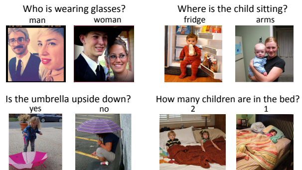
Figure 1: Examples from our balanced VQA dataset.

Finally, our data collection protocol for identifying complementary images enables us to develop a novel interpretable model, which in addition to providing an answer to the given (image, question) pair, also provides a counter-example based explanation. Specifically, it identifies an image that is similar to the original image, but it believes has a different answer to the same question. This can help in building trust for machines among their users.