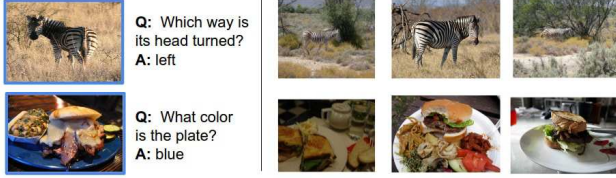
Figure 4: Three counter-example or negative explanations (right three columns) generated by our model, along with the input image (left), the input question Q and the predicted answer A .

I , the question asked Q , the answer A_{pred} predicted by the VQA head in our model, and top three negative explanations produced by the explanation head. We see that most of these explanations are sensible and reasonable – the images are similar to I but with answers that are different from those predicted for I .