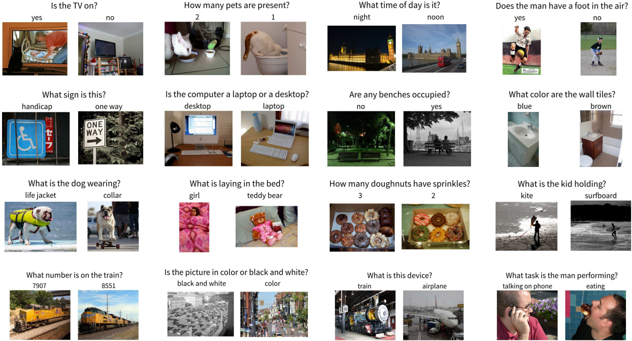
Figure 2: Random examples from our proposed balanced VQA dataset. Each question has two similar images with different answers to the question.

a machine must choose to caption an image with one of two similar captions. To compare, Hodosh et al. [14] implemented hand-designed rules to create two similar captions for images, while we create a novel annotation interface to collect two similar images for questions in VQA.