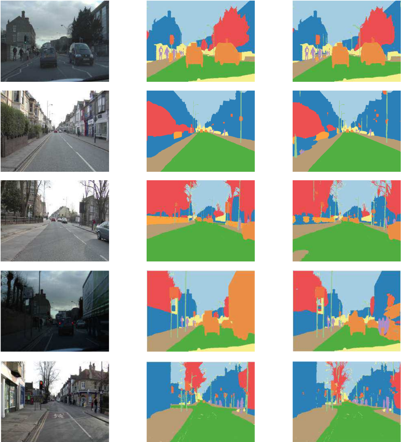
Figure 3. Qualitative results on the CamVid test set. Pixels labeled in yellow are void class. Each row represents (from left to right): original image, original annotation (ground truth) and prediction of our model.