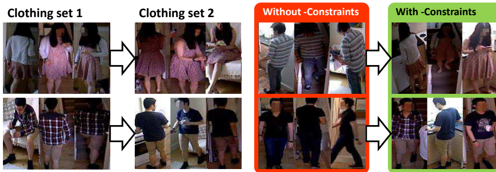
Figure 3. Qualitative illustration of success cases for constraints. People change from their starting clothing set to their second clothing set. Without negative constraints, the model incorrectly classifies another person due to having a similar appearance (red border). By including constraints, this can be mitigated (green border).