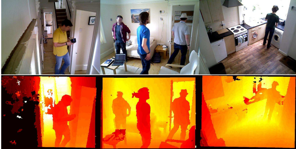
Figure 2. LIMA Dataset: Example RGB frames (top) and depth sensor measurements (bottom, darker is nearer) from cameras 1, 2, and 3 (left-to-right)

tween people, or people and background shapes. To simulate future improvements to tracker reliability, we remove detections from a tracklet that are not labelled with the majority identity label. For building a reliable tracklet appearance model, we remove detections that indicate a prone position, such as lying down, (detection aspect ratio r < 0.75 ) and lastly subsample tracklet’s detections when they are more than 400 prior to feature extraction.