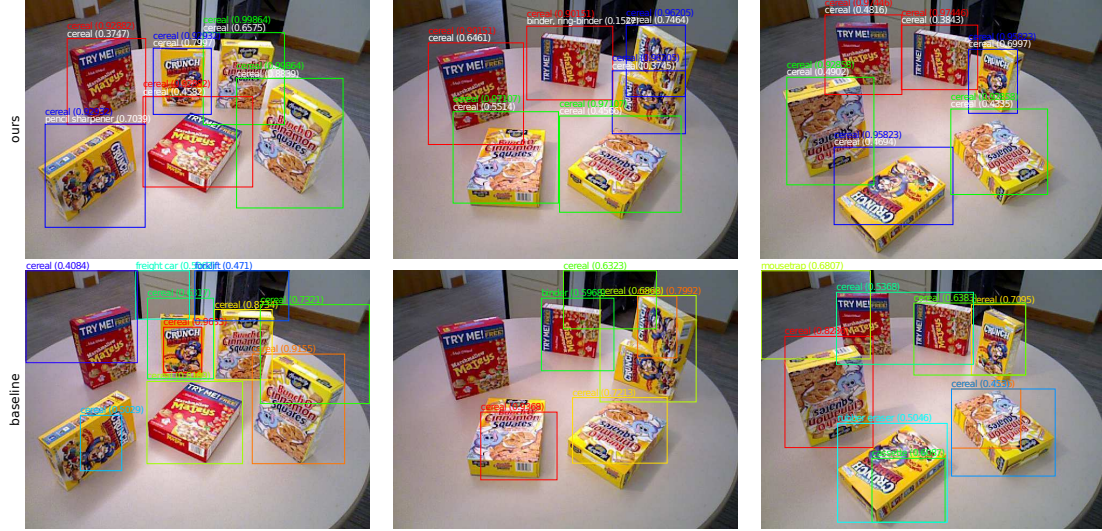
Figure 2. Detection and classification results using our method (top) and the baseline method (bottom). For our method the bounding box colors indicate object association. We show both the individual (white) and joint (in color) probabilities. For the baseline method we only show the regions with probability larger than 0.4 for better visualization.