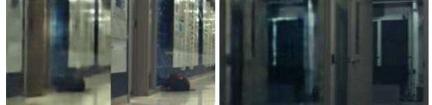
Figure 2. Two examples of detected anomalies. Each image pair shows a generated image on the left and actual image on the right. In the left pair, note that the generated backpack is a different color; in the right pair, note that the generated door has no door-knob.

We present an anomaly detection approach for a mobile autonomous robot based on a GAN. In an unsupervised manner, our approach uses the GAN to learn a model of normality for a given environment, and then uses this learned