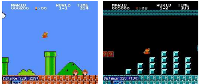
(a) learn to explore in Level-1 (b) explore faster in Level-2

This work belongs to the broad category of methods that generate an intrinsic reward signal based on how hard it is for the agent to predict the consequences of its own actions, i.e. predict the next state given the current state and the executed action. However, we manage to escape most pitfalls of previous prediction approaches with the following key insight: we only predict those changes in the environment that could possibly be due to the actions of our agent or affect the agent, and ignore the rest. That is, instead of making predictions in the raw sensory space (e.g. pixels), we transform the sensory input into a feature space where only the information relevant to the action performed by the agent is represented. We learn this feature space using self-supervision – training a neural network on a proxy inverse dynamics task of predicting the agent’s action given its current and next states. Since the neural network is only required to predict the action, it has no incentive to represent within its feature embedding space the factors of variation in the environment that do not affect the agent itself. We then use this feature space to train a forward dynamics model that predicts the feature representation of the next