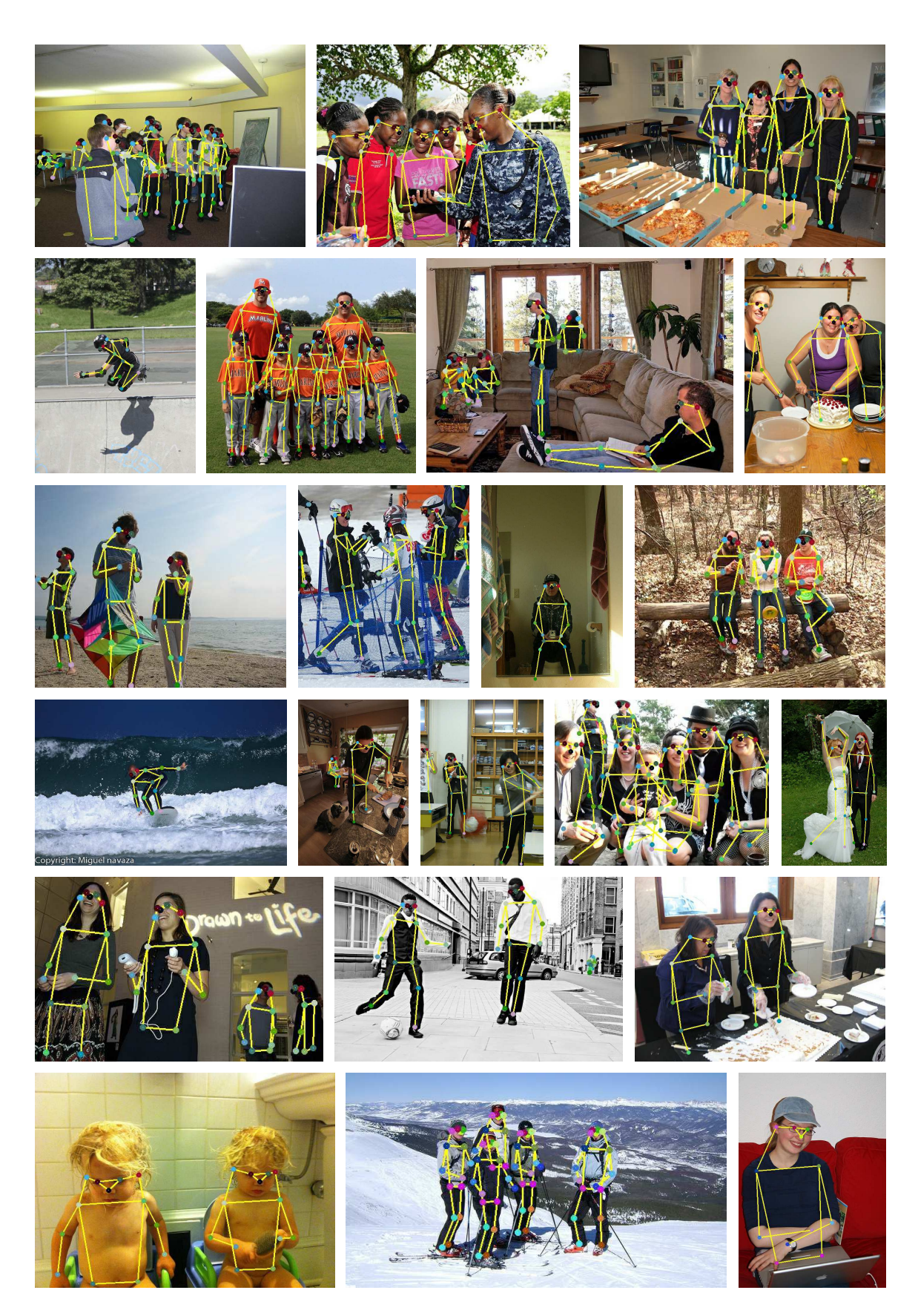
Figure 3. Some results of our method.