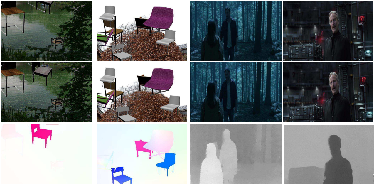
Figure 1. The first two columns show the examples of the FlyingChair dataset [9]. From top to bottom are the first frame, the second frame, and the ground truth optical flow between them, respectively. The last two columns show the examples of 3D movie frames and the estimated disparity map. From top to bottom are the left view image, the right view, and the estimated disparity map.

The merit of this line work does not require manually annotations but still utilized supervised learning by inferring supervisory signals from data structure. For example, Wang et.al. [37] proposed to generate pairs-of-patch by tracking objects in videos and then use a Siamese triplet network to learn feature representations that the similarity between two matching patches should be larger than the similarity between two random pairs. Doech et.al. [7] explored the spatial consistency of image as context prediction task to learn feature representation. Owens et.al. [26] used audio signals from videos to learn visual representations. Other approaches such as [1, 16] have tried to use videos and ego-motion to learn the underlying network. More recently, [24, 11, 20] presented CNN-based unsupervised video representation learning method. In order to capture the temporal information, they design a learning task to verify the sequence of frames is presented in the correct order or not. Despite these approach having to determining the correct temporal order, but do not learn dense pixel-level movement. Different from existing approaches, we use the geometry task to learn the dense pixel-level geometry cues, which can serves as more strong supervised signals to learn robust video feature representation for the semantic recognition task.